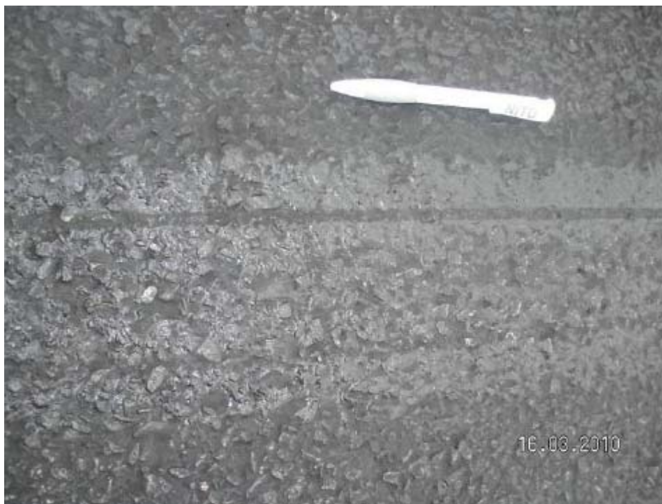
Figure 2 - Shiny wheeltrack, covered aggregate and filled-up voids

Bitumen emulsion “rejuvenators” such as fog sprays have been used extensively on roads and airports on chip seals but less commonly on hot mix asphalts. These use an emulsion of bitumen and water with the addition of an emulsifier or emulsifying agent to ensure stability. The bitumen emulsion is often further diluted with water. The fog spray is sprayed on the HMA surface to add more bitumen which rebinds any loose and oxidised material. Very soon after spray application, the emulsion breaks, and the water is driven off leaving the residual bitumen in place.