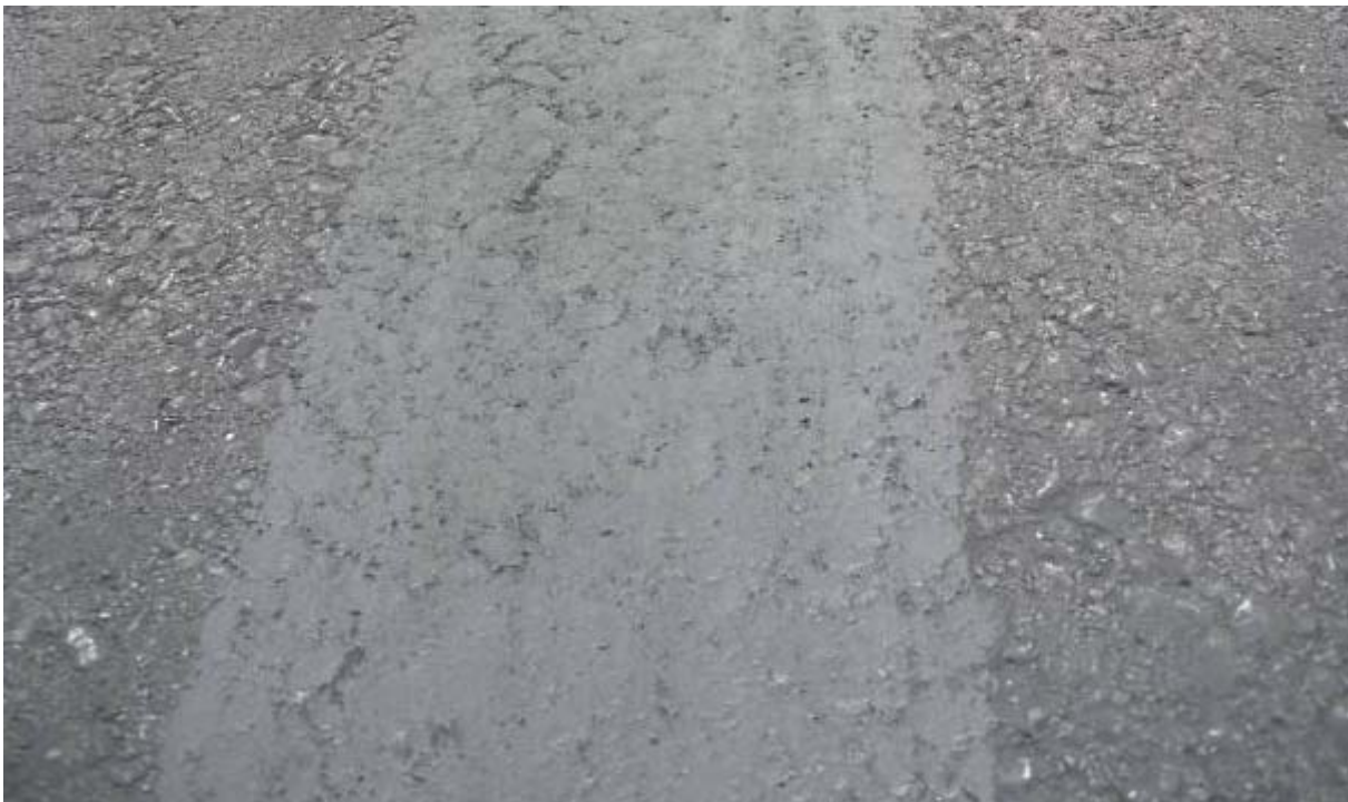
Figure 4 – close up detail of shiny wheeltracks on George 11/29 runway

The problem was also seen with the USA T-33 accident (reasonable friction using a pendulum type decelerometer), Chile accident (British Pendulum Test inconclusive, but a CMFE later showed poor friction), and the Norway accident (CMFE not able to detect slippery conditions). It is confounded by the limitations of CMFE in measuring friction on a