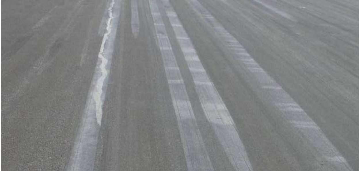
Figure 3 – shiny wheeltracks on George 11/29 runway

the use of a self wetting continuous friction measuring device (CMFE). This has been done successfully throughout the world for many years. Yet the experiences here show that CMFE cannot be relied on to detect reverted rubber skidding on slippery runways with poorly performing rejuvenation. Such runways can in fact show adequate CMFE results and be slippery to aircraft when wet, as was seen in the investigation of the accident at George.