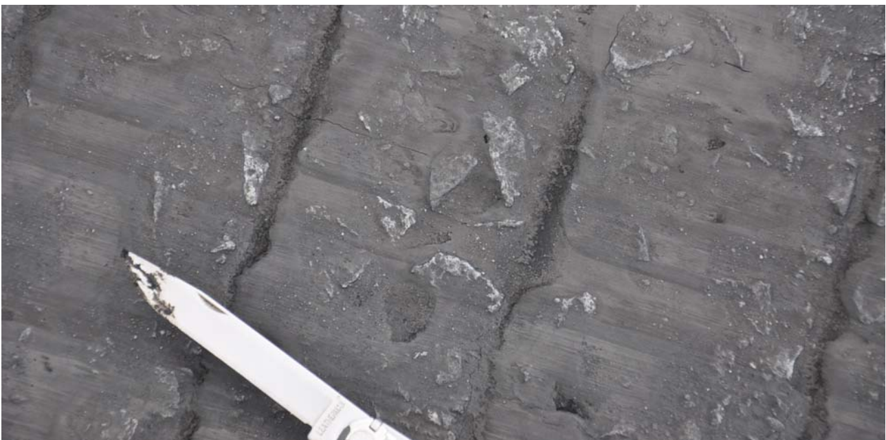
Figure 5 – close up of surface treatment rejuvenation with poor microtexture and worn inadequate grooves

The best result can be had by not rejuvenating runways at all, but by overlaying or replacing the hotmix asphalt when it is aged. This also allows correction of the ruts and depressions that could lead to dynamic aquaplaning.